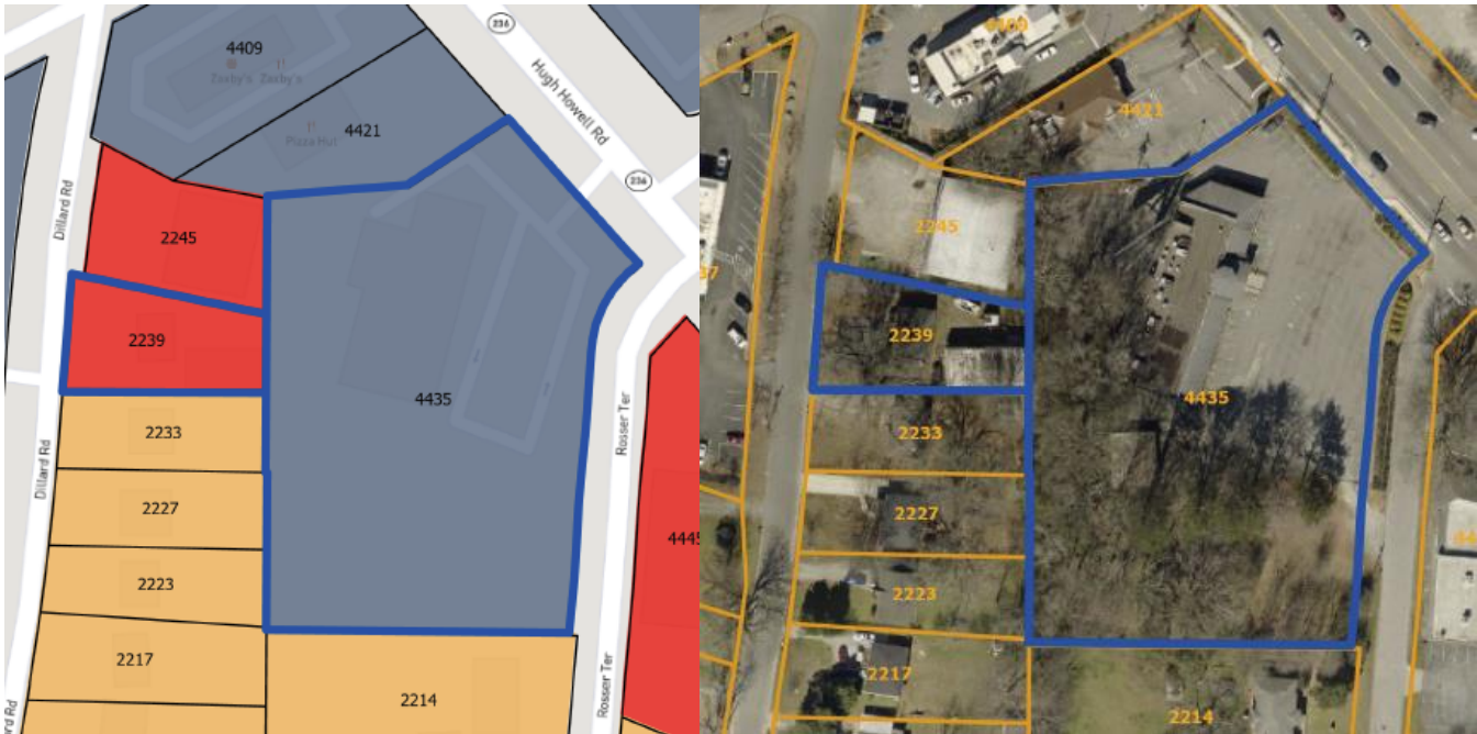
Zoning and Aerial Exhibits showing surrounding land uses.